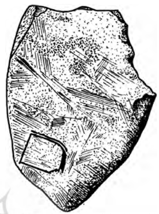
Figure 1. Quartzite slab from Bilzingsleben with an incised D-shape (image from Bednarik 1995: 609)

Artifacts from the German site of Bilzingsleben have received considerable attention in literature. These objects exhibit sets