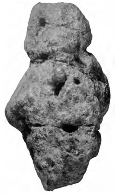
Figure 4. Bekharat Ram figure, purported to be a deliberate female form. The incisions are consistent with an anthropogenic origin, but the meaning of the final product has been subject to debate.

Unlike the Ukrainian pieces, the Bekharat Ram (Figure 4) figure has received credibility from scientific scrutiny. Excavated from the Golan Heights in the early 1980s, this "plumsize" piece of volcanic tuff gained notoriety when archaeologist Goren-Inbar observed that its incisions resemble a woman. According to Goren-Inbar, an early human saw the suggestion of a female form within the pebble's natural cracks and then embellished them into a