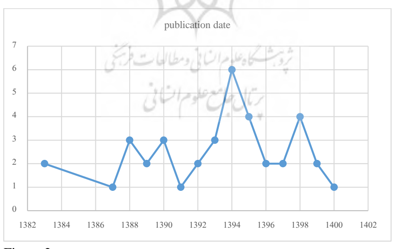
Figure 2 Frequency of published articles in different years

Examining the frequency distribution chart of the year of publication yields interesting results. Figure 2 shows that 2015 has the highest frequency with six publications, while 2016 and 2019 are the most productive years in this subject with four papers published. Another important item to notice is that these issues were not addressed until the mid-2000s. Articles on this topic have been published since 2004, and this issue was not previously considered by scholars.