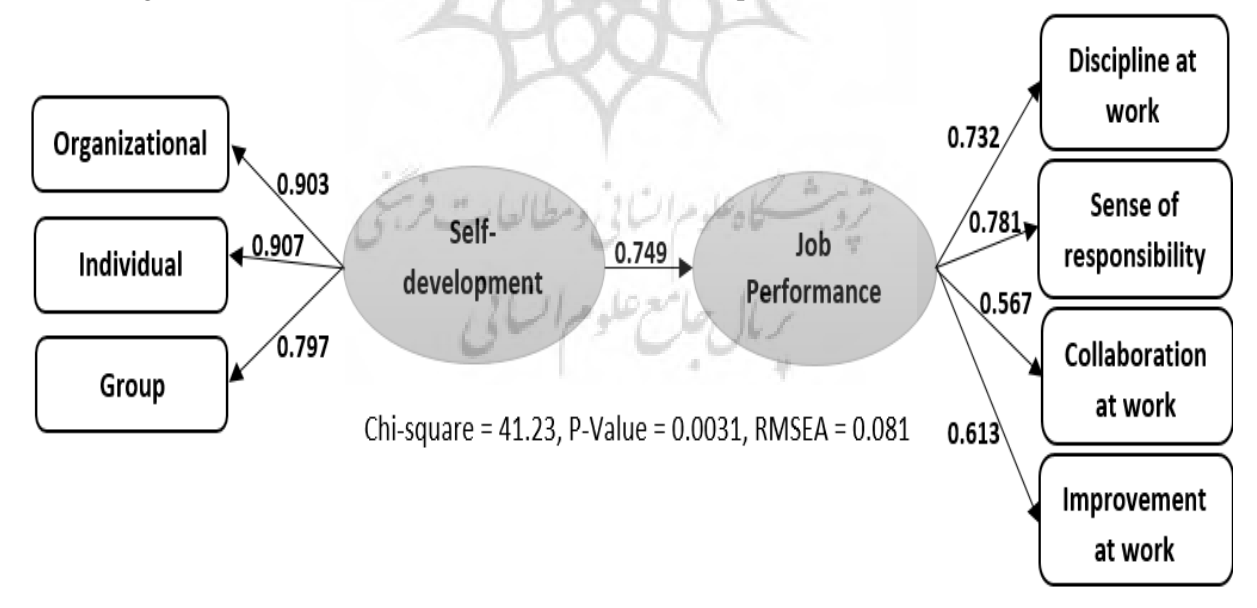
Figure 2. Structural equations modeling of principals' self-development and job performance (path coefficients)