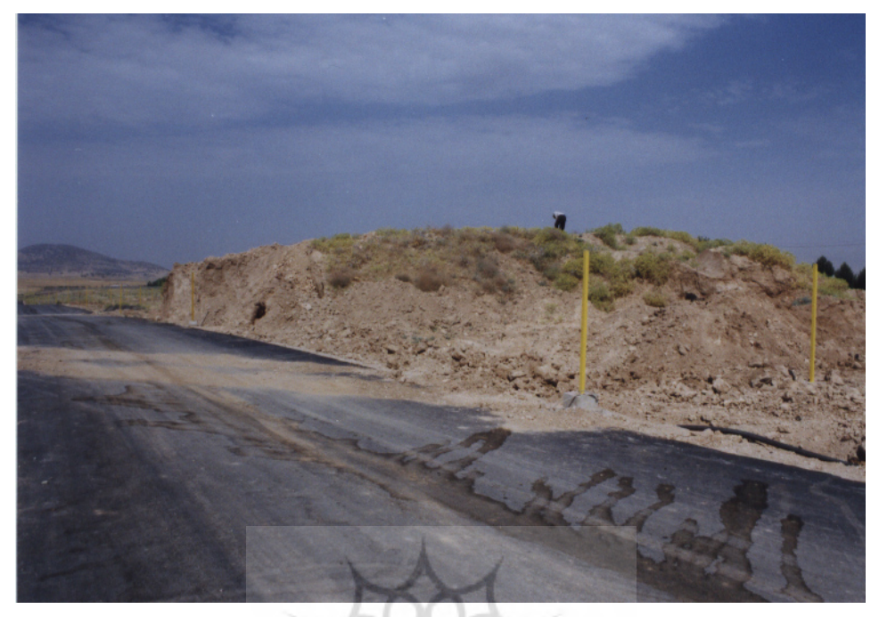
Fig. 2. Achaemenid Site at Chah Mur, 2008 (Archive, ICHTO, Fars, Iran).

cutters through the letters of the Lydian alphabet (Roaf, 1983: 74-65). The double-axe in Group 6 is one of the important characteristics of Carian masons. which has been found not only in Persepolis but also in Anatolia as well as Egypt (Kucukeren, 2019: 192). The presence of 72 masons and goldsmiths from Caria of the Anatolian region in the tablets of the Persepolis treasury shows that those workers were paid in the form of cash draft called Shekela in the ninth month of the 19th year of the reign of Xerxes (Cameron, 1948: PI XXIII, p 143. No.37). These Carian workers accompanied by another group of Lydian transported cedar from Lebanon to Babylon and from there to Susa (Cameron, 1948: p 143).