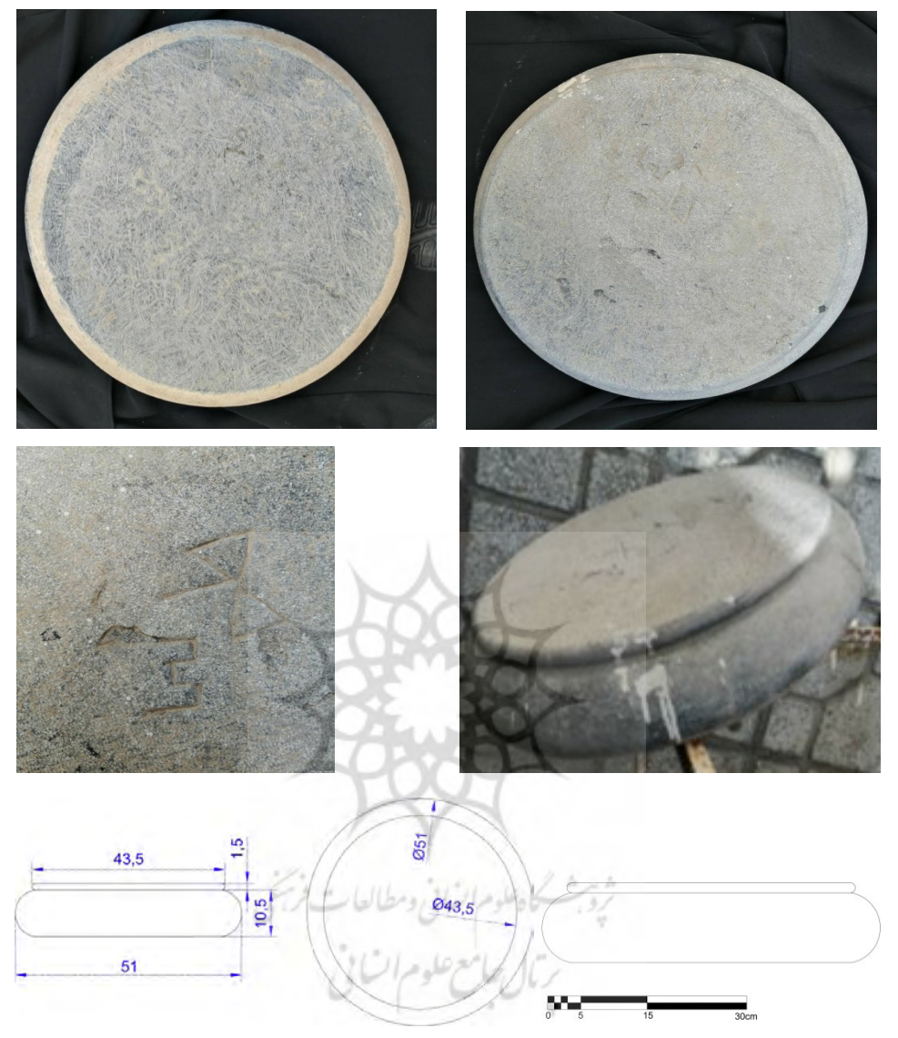
Fig. 3. Torus base, Chah Mur. Bottom and Surface of Torus: There Are Two Fitter Marks on the Upper Surface.

royal road. Identifying the Achaemenid sites on the route from Persepolis to Susa and Sardis in Asia Minor can be helpful in recognizing the map of the royal road between these important centers of power during the Achaemenid period and