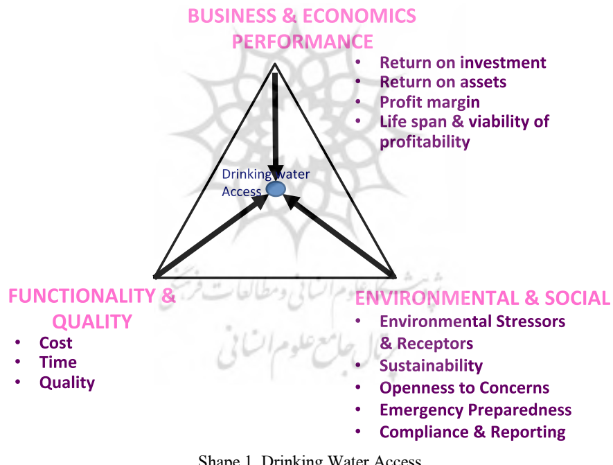
Shape 1. Drinking Water Access

In order to achieve universal and equitable access to safe and affordable drinking water for all, the countries have to scale the funding required for this task. Yet accomplishing provision of affordable drinking water is a huge challenge for many countries, including where the government contribute financial assistance. For the purpose of improve water affordability, where there are growing challenges, we need to take into consideration several factors that are intertwined and balance each factor with integrated approach. It requires having the holistic view on affordability and measure it by complying with predefined criteria of each angles as described below.