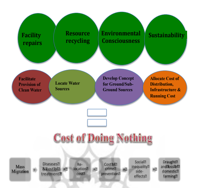
Shape 2. Factors Considered for Provision of Affordable Clean Water

Affordability needs to be considered with regard to two types of costs: