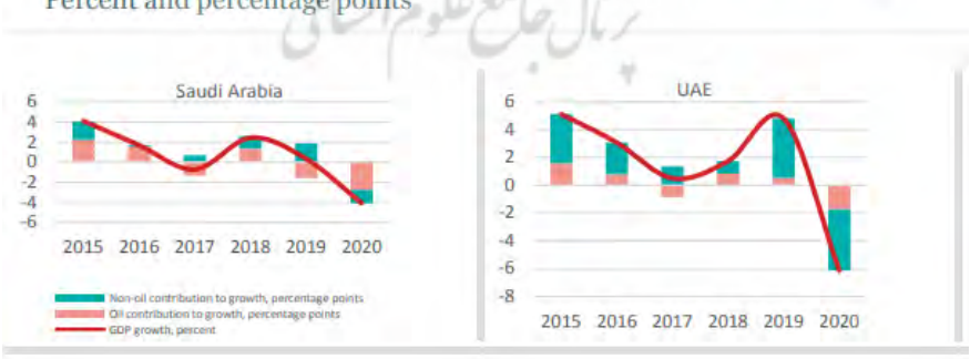
Figure (2): Impact of Corona Pandemic Shock on GDP, Oil and Non-Oil Economy Share in Development

GDP growth, oil contribution to growth, and non-oil contribution to growth Percent and percentage points